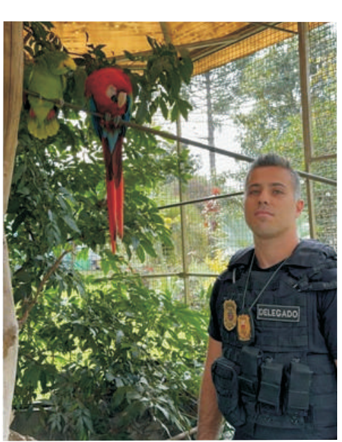
This is the Scarlet Macaw (Ara Macau) is protected by the Convention on International Trade in Endangered Species of Wild Fauna and Flora (CITIES)