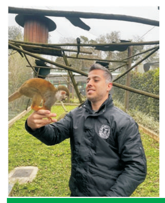
Squirrel monkey (Saimiri vanzolinii) seized during the operation.

Many threatened species have been recovered, such as the Scarlet Macaw (Ara macao) and the Axolotls, both protected by the Convention on International Trade in Endangered Species of Wild Fauna and Flora (CITIES). However, evidence shows that this group led the sale of at least ten thousand animals in the last three years alone, with an annual turnover of approximately USD10,000,000. For the success of the investigations, several investigative techniques were used, such as interception of telephone communications, data analysis, investigation into money laundering, hearing of witnesses, informants and experts, all techniques taught during the Environmental Crimes course at International Law Enforcement Academy, in Botswana, in June 2023.