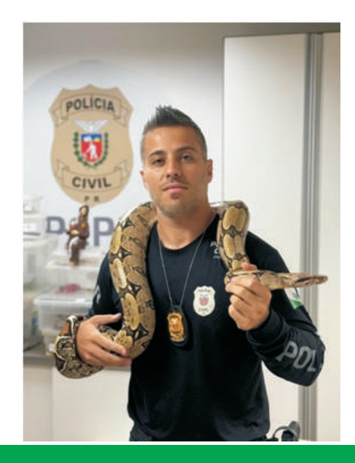
Seized during this operation. The scientific name is Pyton Molurus or Indian Python came from Asia.